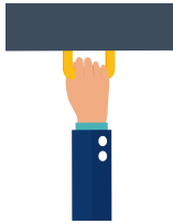
Internal handles above doors