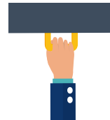
Internal grab handles