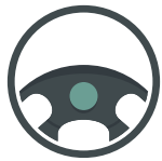
Steering wheel and controls

You must clean any 'high touch' surfaces – those that drivers and/or passengers touch regularly. These include: